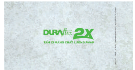
Inkjet printing on DURAflex® 2X floor panel (4 -10mm)